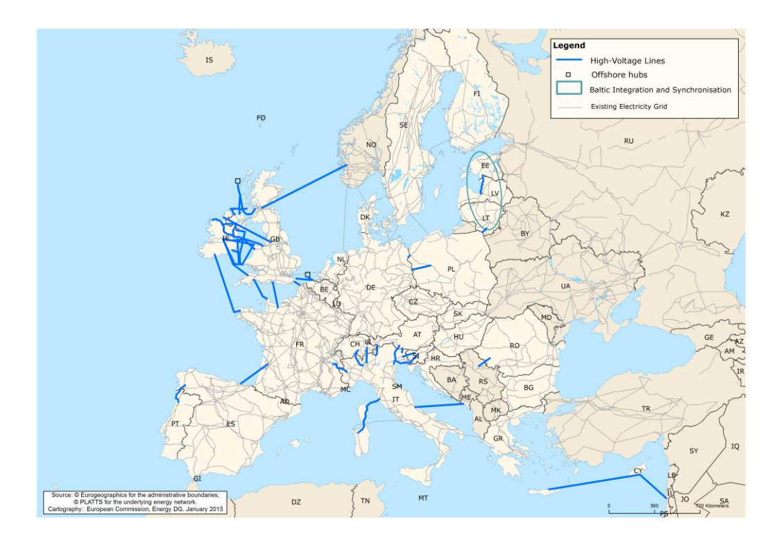
Map of first PCI list for electricity interconnectors in Member States below 10%

enabling future interconnections, out of which 37 projects are involving Member States that currently have an interconnection level below 10%.