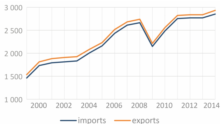
Figure 1: Intra-EU-28 trade – imports and exports in billion euros

A number of studies demonstrate that the Schengen area increases the economic benefits of its participating states. Indeed, intra-European trade has increased over time, reaching more than €5 trillion in 2014 (see Figure 1). One 2014 academic study shows that the effects of Schengen on European trade are positive. When two countries are members of the Schengen area, bilateral net trade increases by 0.09% every year. Furthermore, the net increase in immigration between two Schengen countries has a statistically significant impact; a 1% jump in immigration is linked to a 0.09% increase in imports. Another study , from 2011, analysed the sources and size of trade barriers across countries and industries. In the case of Europe, it shows that the Schengen area significantly decreases the trade frictions between trade partners and facilitates cross-country trade integration.