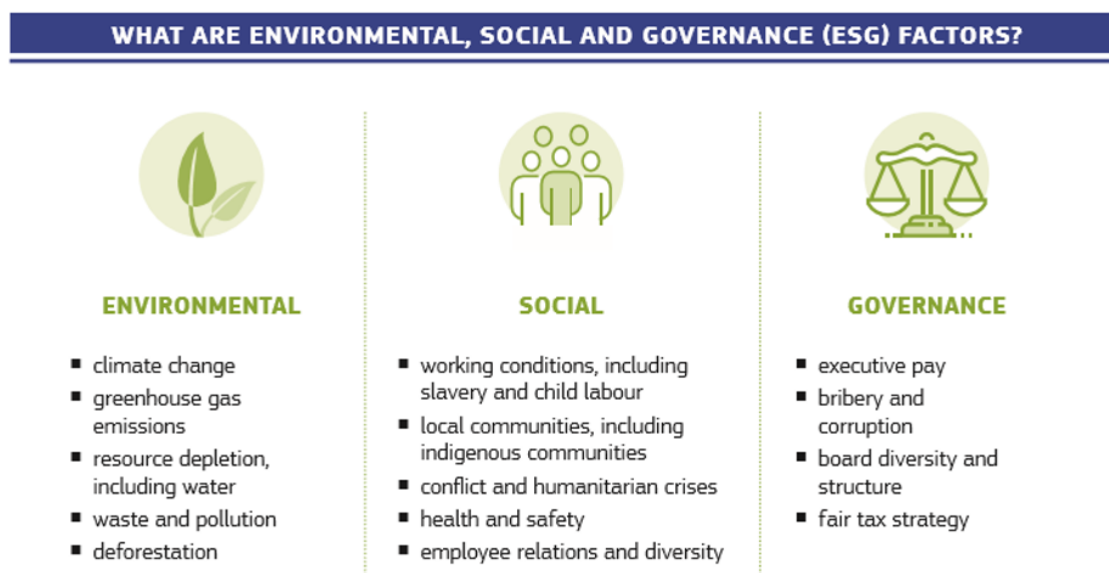
Table 1 – Environmental, social and governance (ESG) factors