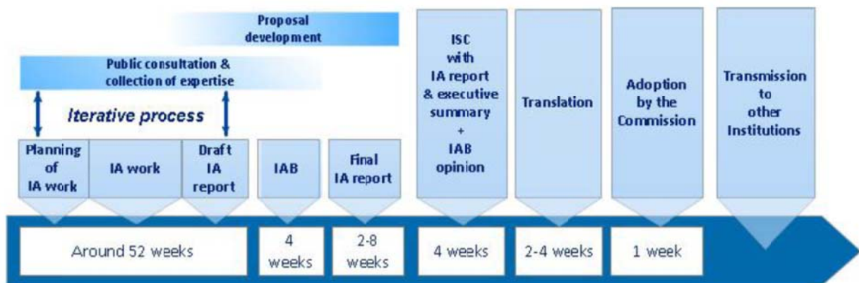
Figure 2 – Countdown for preparing IA in the European Commission