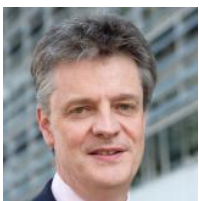
Green paper on capital Markets Union, Jonathan Hill, Commissioner Financial Stability, Financial Services and Capital Markets Union

Elżbieta Bieńkowska, Commissioner for Internal Market, Industry, and Entrepreneurship. It is the first time that the Commissioner meets the ITRE Committee after the hearing concerning her confirmation as Commissioner. She will outline strategic goals and industrial policy plans for 2015 and provide information concerning the internal market for Earth observation satellite data.