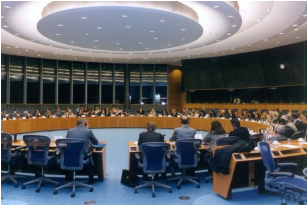
CONCILIATION COMMITTEE Conciliation is the third and final phase of the Codecision procedure

The EP website of the Conciliation Committee, available in English and French, contains relevant information on conciliation procedures and all published codecision legislation documents in all official languages.