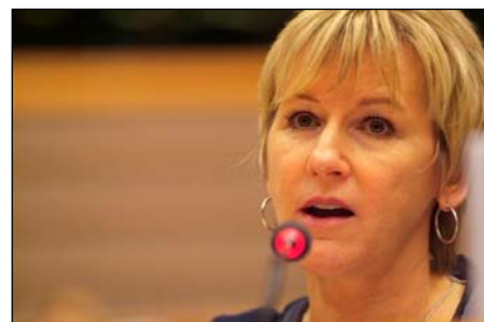
Ms Margot Wallström, Vice-President of the European Commission

Ms WALLSTRÖM further highlighted the vast number of policy areas that the Northern Dimension aimed to tackle, and specifically mentioned energy, transport, forestry, trafficking in human beings, organized crime, health issues, protection of indigenous peoples, and - most importantly - the environment. She drew the attention to the deterioration of water quality in the Baltic Sea, and to the Arctic region suffering the impact of climate change. In this context she pointed to the setting up of the Environmental Partnership as one of the major achievements of the Northern Dimension. She further assured that the Commission was determined to continue to play its part in the region and to deliver on their common objectives, particularly in regards to climate change impacts. By way of conclusion, Ms WALLSTRÖM highlighted the value of common ownership in reaching the goals of the Northern Dimension policy.