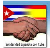
Solidaridad Española con Cuba Madrid, Spain