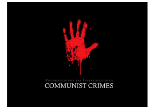
Foundation for the Investigation of Communist Crimes Tallin, Estonia