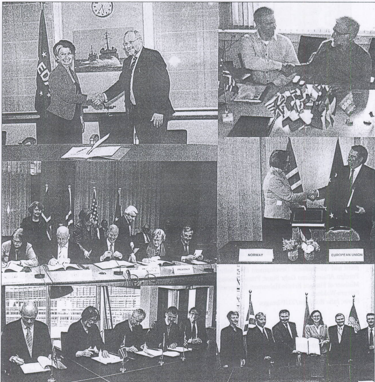
Figure 1.2 Signing of agreements with the European Union (cont.)