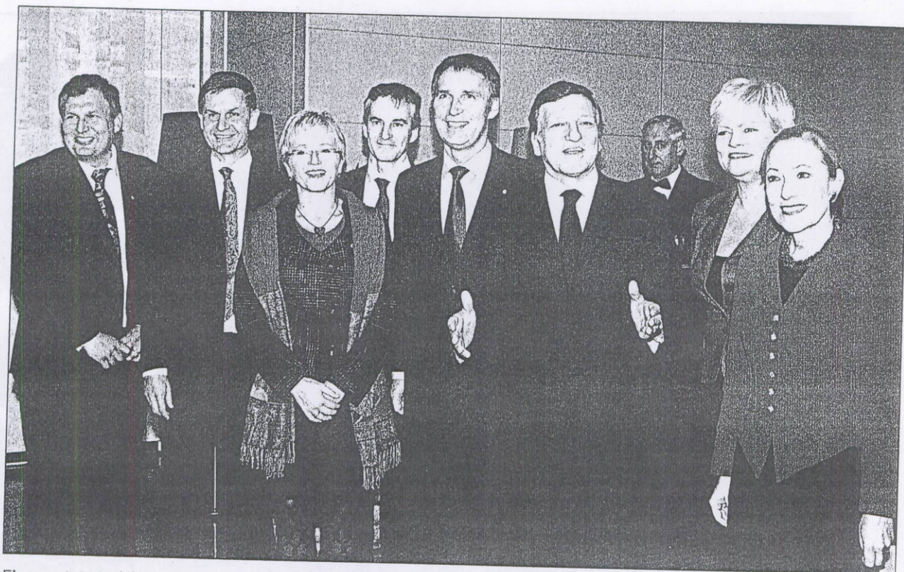
Figure 1.3 Lobby nation

Many Norwegian ministers visit the EU and the European Commission. In the autumn of 2008, several members of the current Norwegian Government visited Brussels. From the left: Minister of Petroleum and Energy Terje Riis-Johansen; Minister of the Environment and International Development Erik Solheim; Minister of Transport and Communications Liv Signe Navarsete; Minister of Foreign Affairs Jonas Gahr Støre; Prime Minister Jens Stoltenberg; Minister of Finance Kristin Halvorsen; European Commission President Jose Manuel Barroso; European Commissioner for External Relations and European Neighbourhood Policy Benita Ferrero-Waldner.