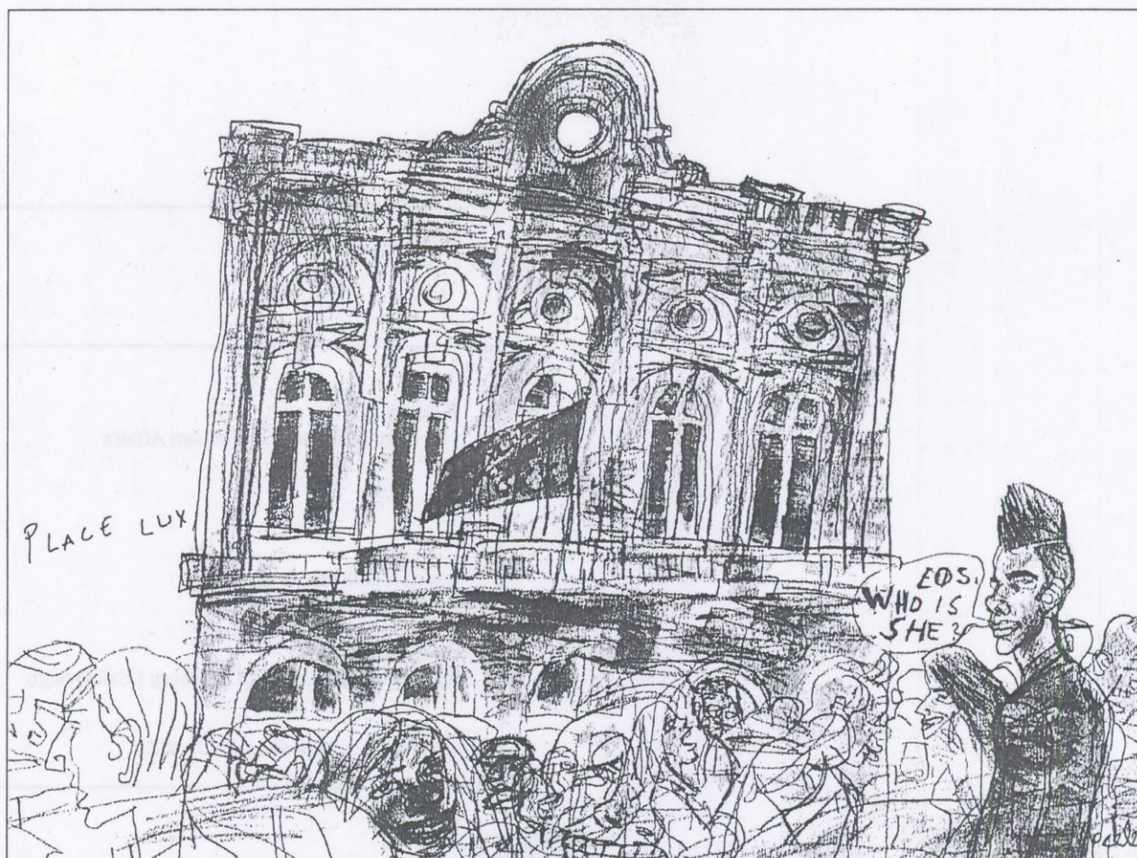
Figure 1.4 Place Lux

Place Luxembourg, situated close to the European Parliament, is one of the favourite meeting places for people working with EU affairs in Brussels. It is also possible to find Norwegians among the crowds that gather here after office hours. Their home country is tied to the EU through the "EØS-avtalen" (the EEA Agreement - an agreement most people in Place Lux have never heard of. Illustration: Per Elvestuen