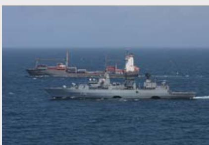
EU NAVFOR warship escort