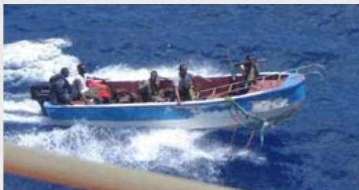
Pirate attack skiff