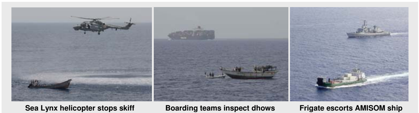
Sea Lynx helicopter stops skiff