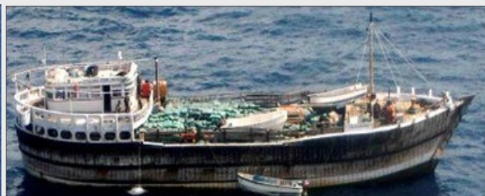
Pirate Mothership (dhow with skiffs)