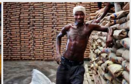
WFP in Mogadishu

As a result of its close cooperation with regional governments such as Kenya and The Republic of the Seychelles, suspected pirates captured by the EU NAVFOR have been transferred to competent authorities with a view to their prosecution and conviction.