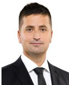
Mr Lajos KEPLI

Committee on Sustainable Development The Movement for a better Hungary (JOBBIK) - Non-attached