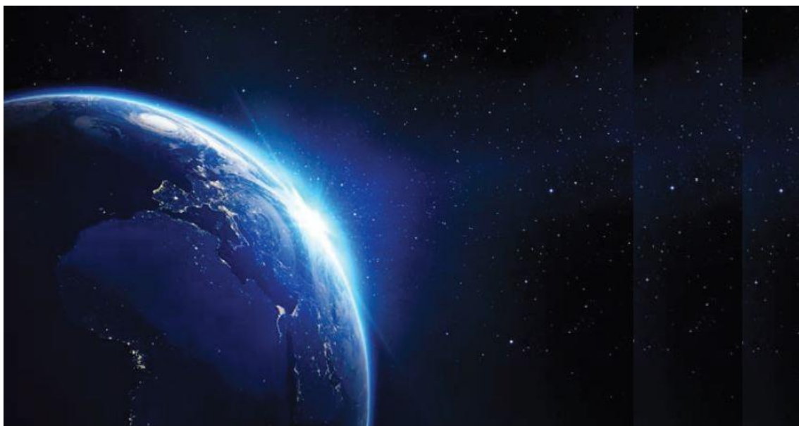
Global Trends image.JPG