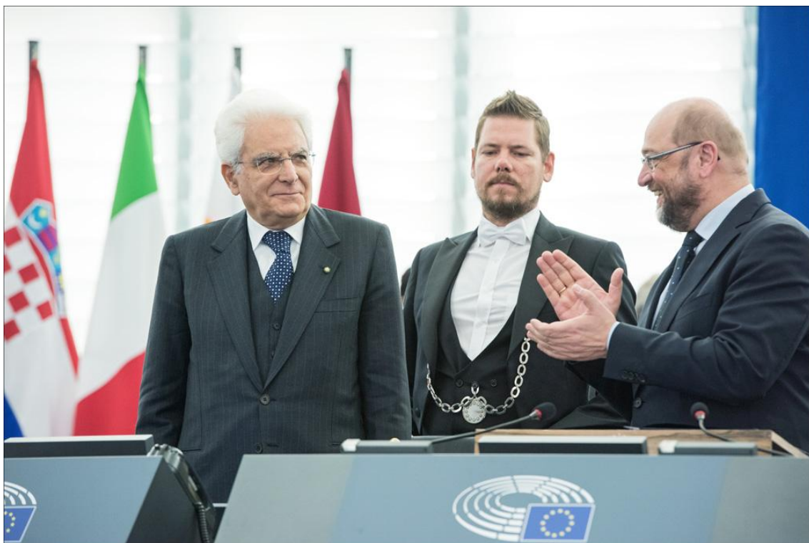
President of the Italian Republic Sergio Mattarella delivers a formal address to the European Parliament on Wednesday 25 November 2015