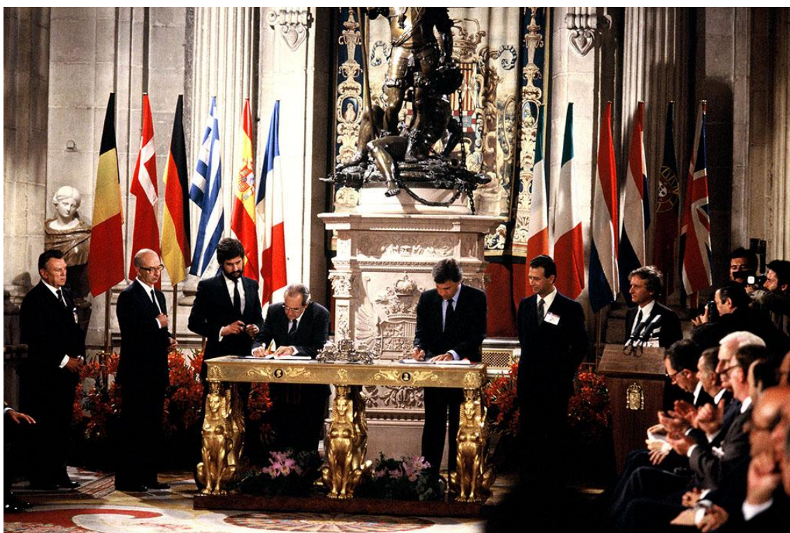
The signing of the Spanish accession treaty