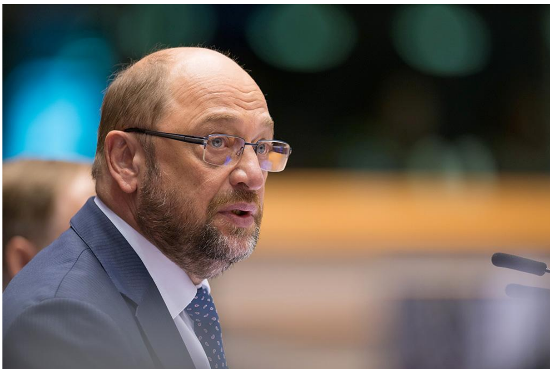
Opening of plenary in Brussels - 16 September 2015