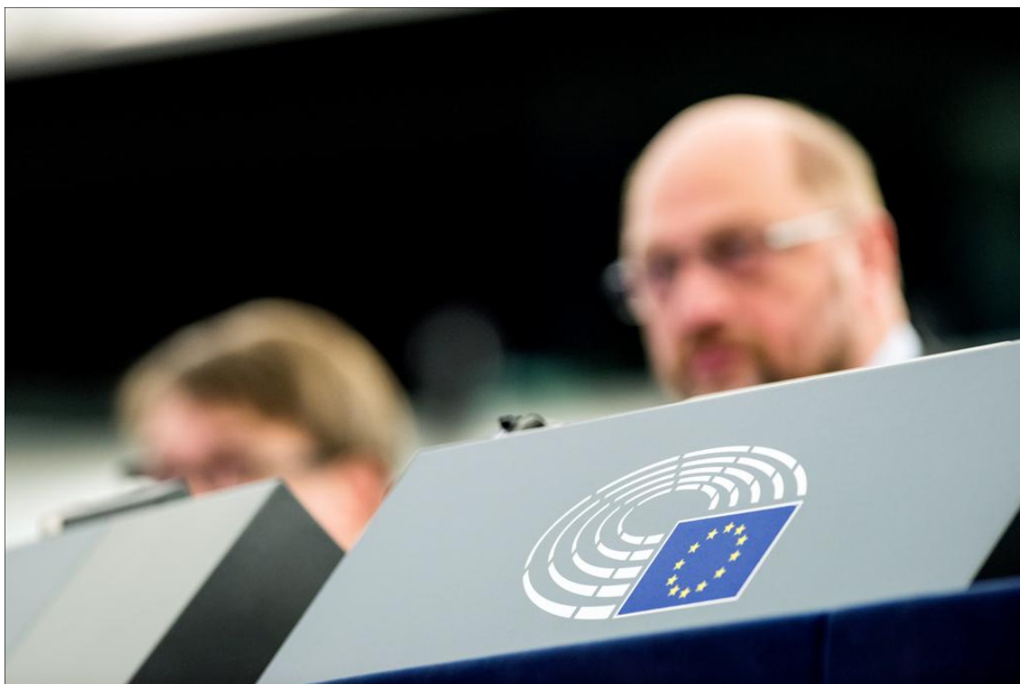
Opening of January 2016 plenary session