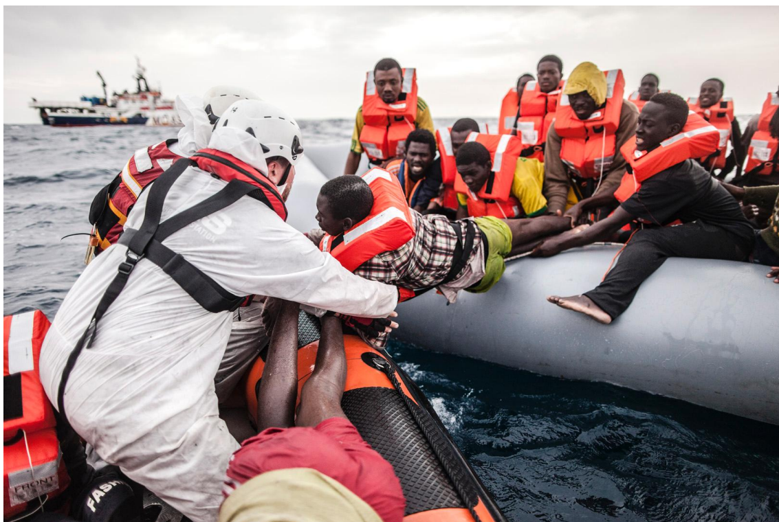
Increase resettlement efforts to prevent dangerous journeys and loss of lives