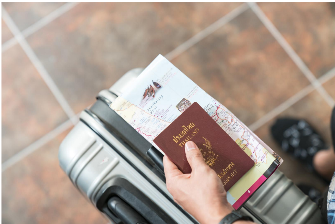
New electronic entry/exit system will make life easier for travellers entitled to enter the EU