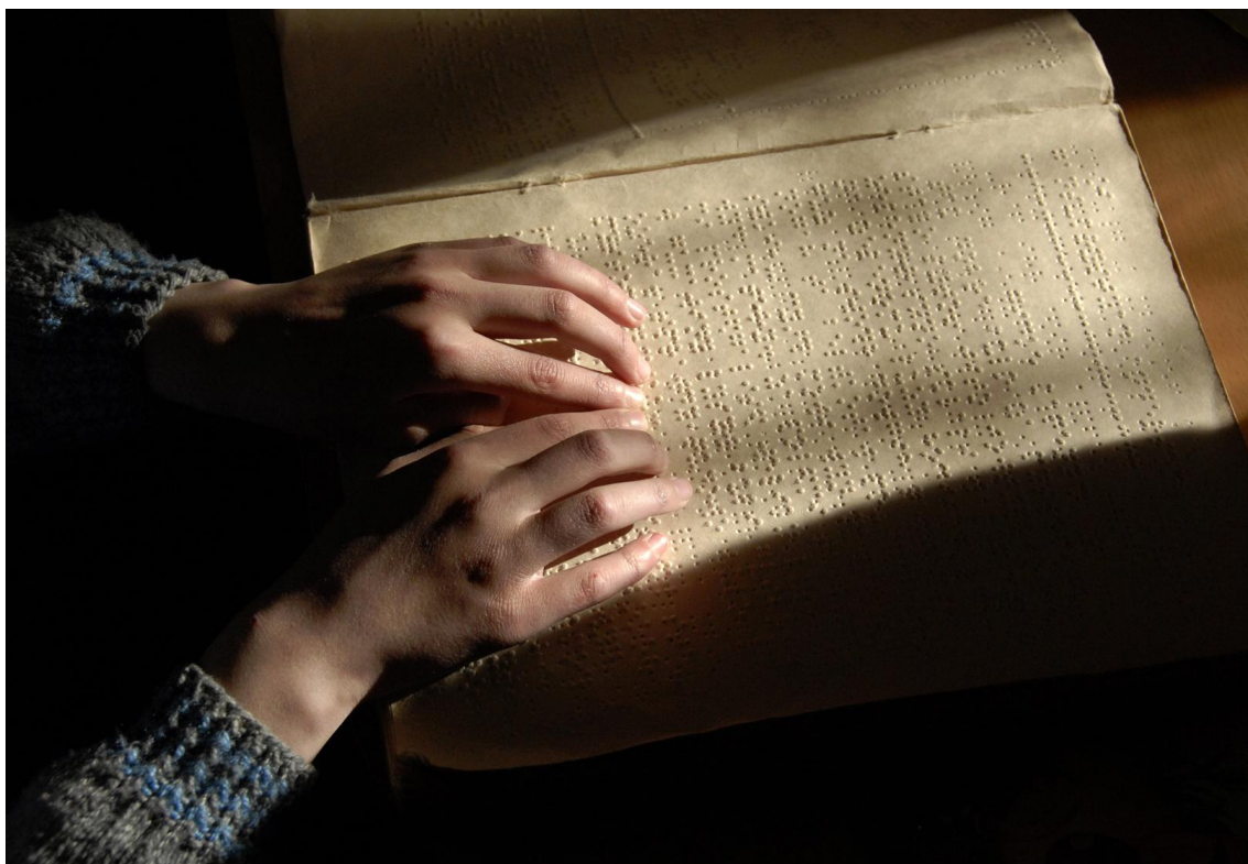
Blind people will soon have access to more Braille books