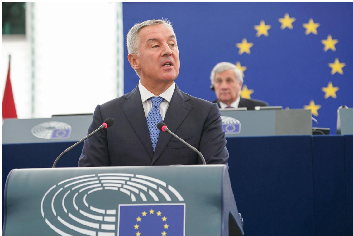
Address by Milo Đukanović, President of Montenegro