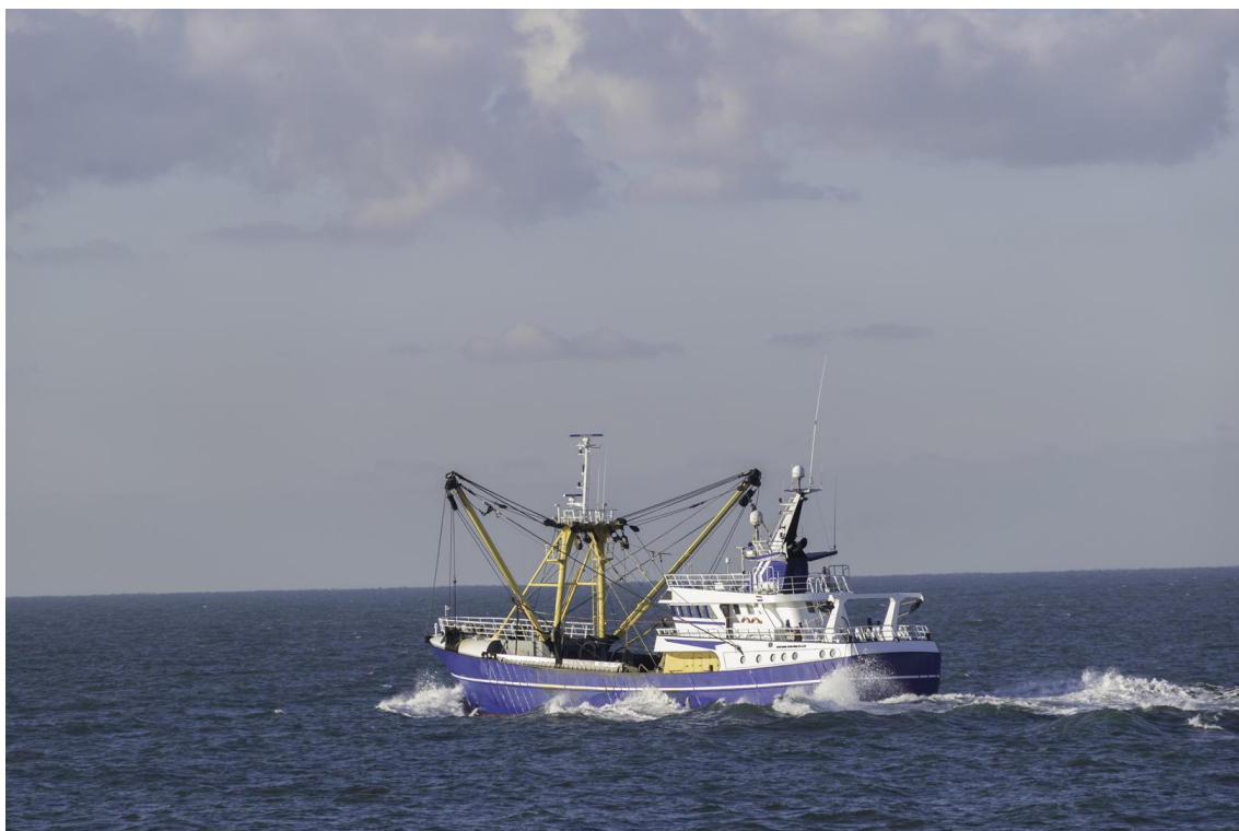
A new multiannual plan for the North Sea fisheries