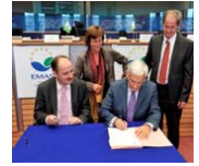
Signing of the EMAS policy on 28 September 2010

EMAS is the system used by the European Parliament (EP) to reduce the impact of its activities on the environment . EMAS is an environmental management system (EMS) based on ISO standard 14001:2004 and EMAS regulations 1221/2009. The Parliament began to apply EMAS following a Bureau decision in 2004.