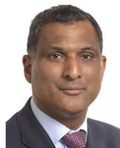
Dr Syed Kamall , MEP (Conservative)

Committee: Chair: Civil Liberties, Justice and Home Affairs