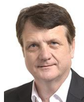
Gerard Batten , MEP (UK Independence Party)

Committee: Legal Affairs, Women's Rights and Gender Equality