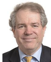
Dr Charles Tannock , MEP (Conservative)