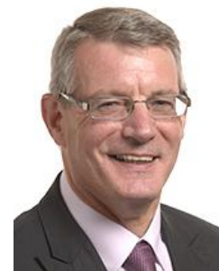
DAVID MARTIN MEP (Labour Party)

ian.hudghton@ep.europa.eu www.hudghtonmep.scot