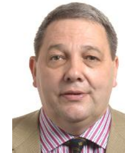
DAVID COBURN MEP (United Kingdom Independence Party)

cstihlermep@btconnect.com www.cstihlermep.com