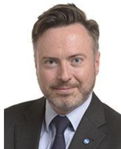
ALYN SMITH MEP (Scottish National Party)

ian.duncan@ep.europa.eu www.ianduncan.org.uk