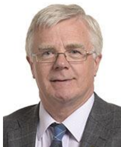
IAN HUDGHTON MEP (Scottish National Party)

Committees: Fisheries; Economic and Monetary Affairs