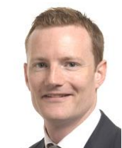
Seb Dance , MEP (Labour)