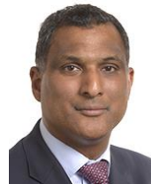
Dr Syed Kamall , MEP (Conservative)

Committee: Chair: Civil Liberties, Justice and Home Affairs