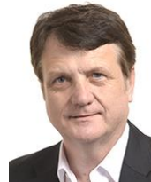
Gerard Batten , MEP (UK Independence Party)

Committee: Legal Affairs, Women's Rights and Gender Equality