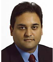
Claude Moraes , MEP (Labour)