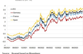
Figure 1: 10-year benchmark yields for the EU and selected issuers (in %)

This briefing is an update on the state of play of EU interest rates and NGEU disbursements, and examines additional questions raised by Members. It emphasises that yearly interest costs could increase quickly in the next few years to reach EUR 10.8 bn before decreasing gradually further on. Assuming the estimates are realistic and that the package will be approved in its current form, the briefing concludes that the 'Own Resource' package proposed by the Commission could be enough to cover these costs.