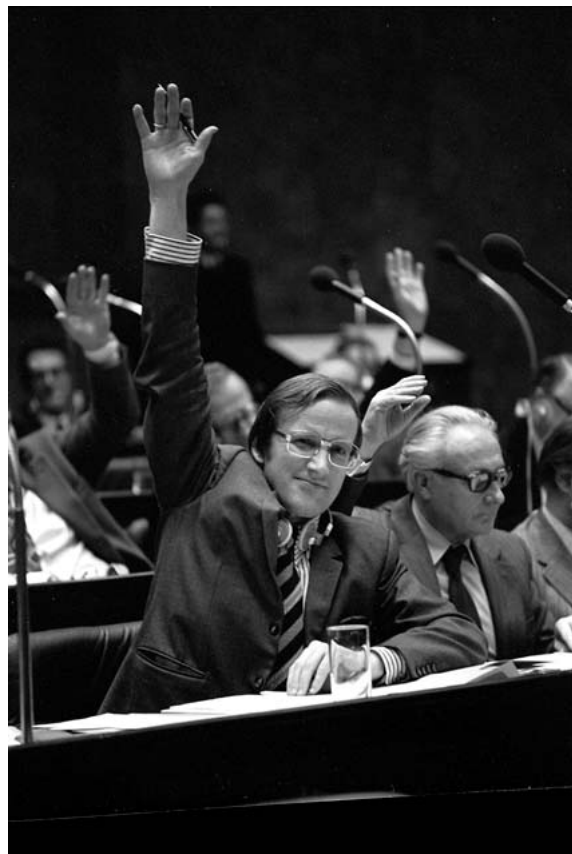
Schelto Patijn in a, debate in Plenary on elections to the European Parliament by direct universal suffrage, 14/01/1975