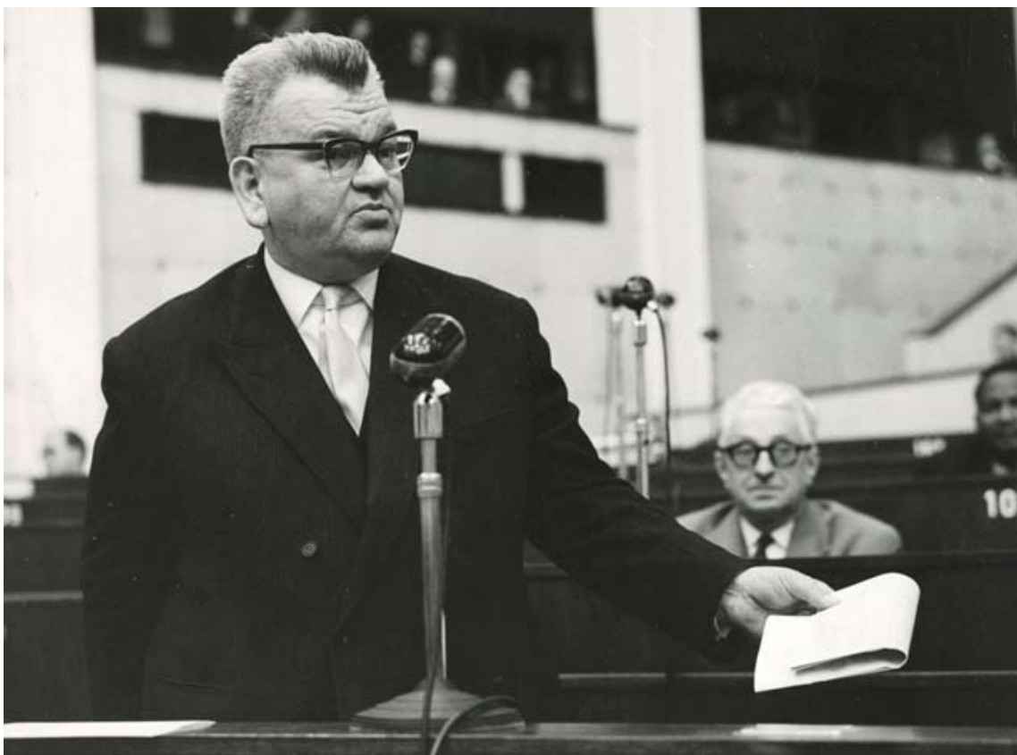
Fernand Dehousse in October 1960

In the Treaty on the European Coal and Steel Community, Member States were given a choice to designate or elect, by universal suffrage, the representatives to the Common Assembly. The Treaty of Rome revoked this option, mandating Member States with the designation of representatives. However, Article 138(3) provided for the future 'elections by direct universal suffrage in accordance with a uniform procedure'. By 1960, Fernand Dehousse, for the Committee on Political Affairs and Institutional Matters of the European Parliamentary Assembly, had prepared a draft Convention on direct elections, adopted by the European Parliament. 1