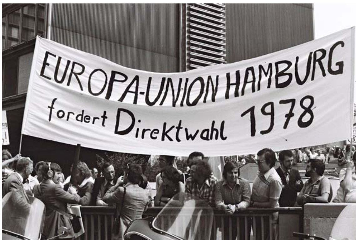
Demonstration in support of European elections outside a meeting of the European Council in Brussels, 12/07/1976

In June, the same cross-group alliance issued yet another motion for a resolution, debated and adopted, requesting the Council to establish the number of seats between 350 and 400. 19,20,21