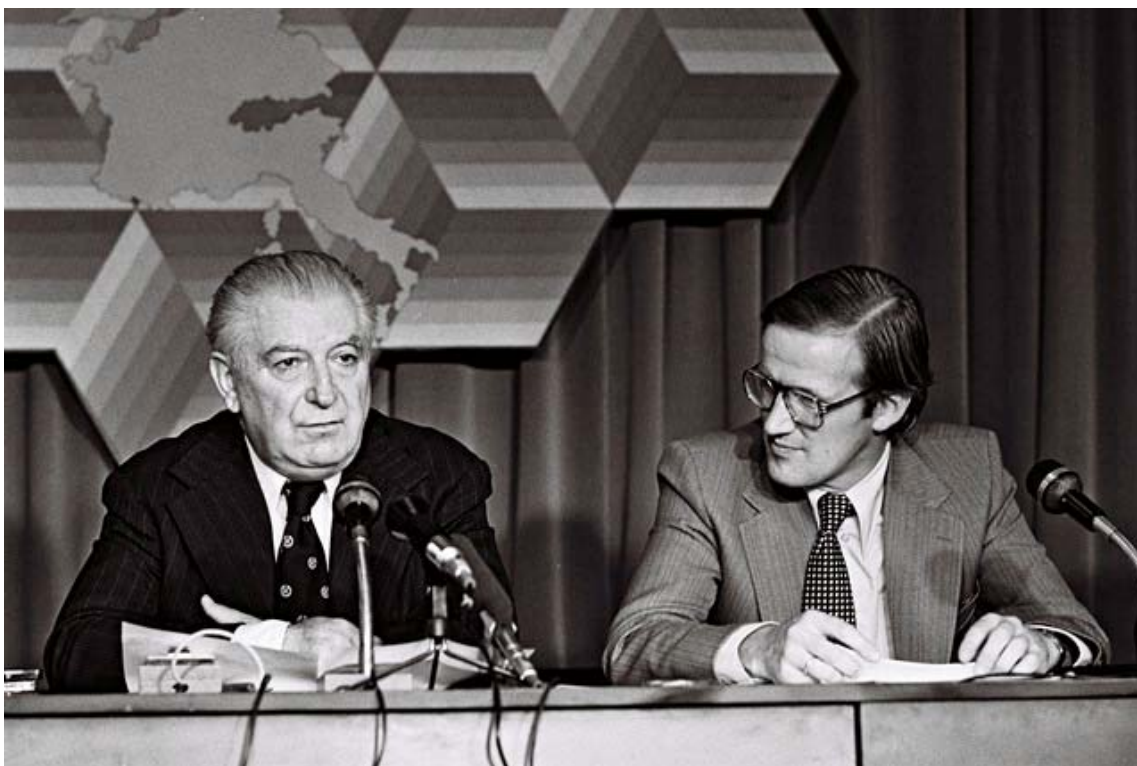
Georges Spénale and Schelto Patijn at a press conference on the agreement on the direct election of the European Parliament, 20/09/1976

Between 13 and 15 September 1976, Schelto Patijn tabled a final motion for a resolution on behalf of the Political Affairs Committee, deploring once more the Council's failure to sign on the draft during their July meeting. 22,23 There was a decision to pass the draft on the 20 of September, however, and Schelto Patijn pleaded that delays beyond this point would jeopardise the deadline for direct elections. President-in-Office of the Council Laurens Jan Brinkhorst assured Parliament that the draft would be signed in five days. Schelto Patijn looked toward the necessary work that lay beyond the signature. Others echoed this need to work hard in the future and the political Groups generally seemed optimistic. However, Gwyneth Dunwoody from the Socialist Group and Gérard Bordu from the Communist and Allies Group opposed any plan for direct elections, the latter regarded them 'as pseudo-democracy'.