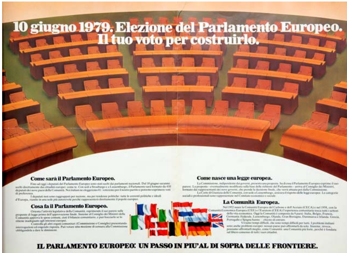
European elections, poster, 1979