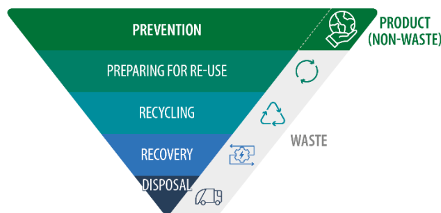
Figure 3 – Waste hierarchy

The Waste Framework Directive – last updated in 2018 – is the EU's legal framework for waste management. It sets out the definitions relating to waste management, waste, recycling and recovery. The directive's Article 4 establishes the five-step 'waste hierarchy', which is the foundation of EU waste management (see Figure 3), establishing an order of preference for managing and disposing of waste. The prevention of food losses and waste is a top priority in this hierarchy.