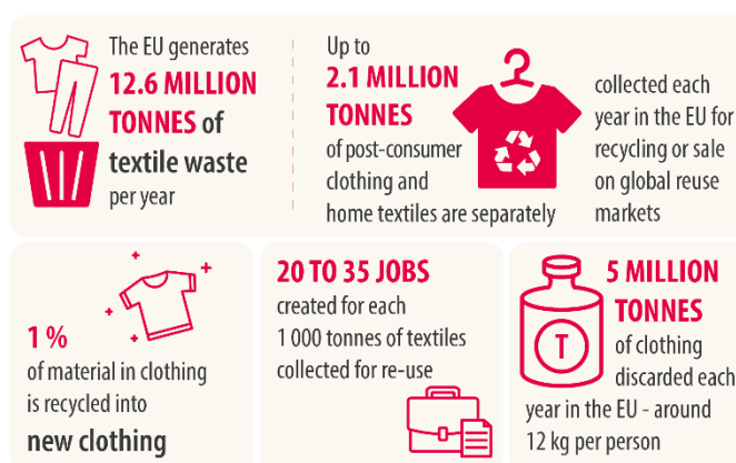
Figure 2 – Textile waste impact