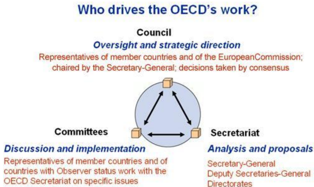
Figure 1: The OECD's Decision-making Mechanism

There are three institutions involved in the OECD's decision-making mechanism: The Council, the Secretariat and the Committees. Figure 1 illustrates their tasks.