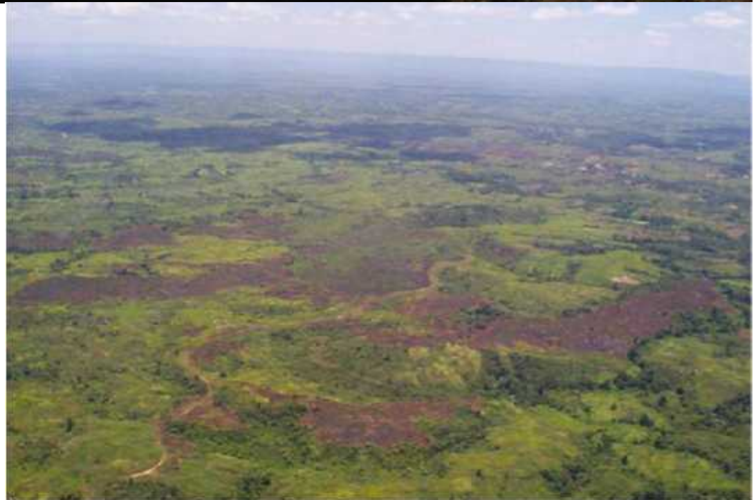
Fire generated degraded grassland Kalimantan