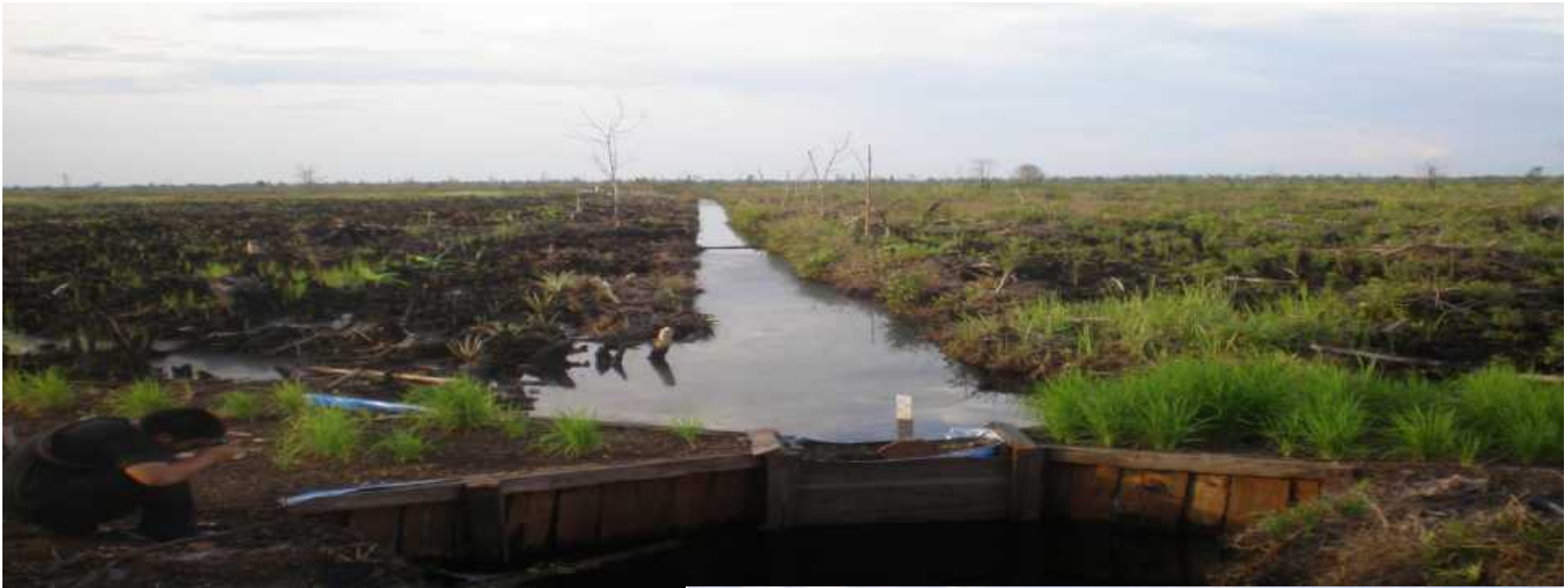
Deforested and drained peatland Central Kalimantan (A Malmer)