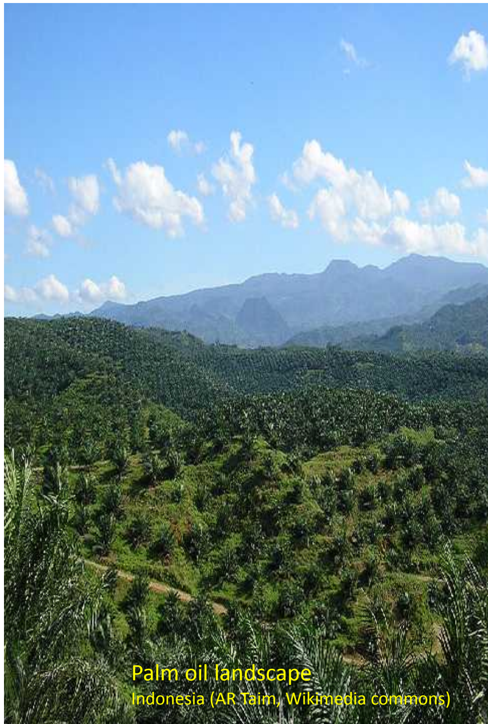
Palm oil landscape Indonesia