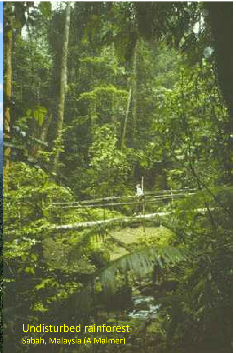
Undisturbed rainforest Sabah, Malaysia (A Malmer)