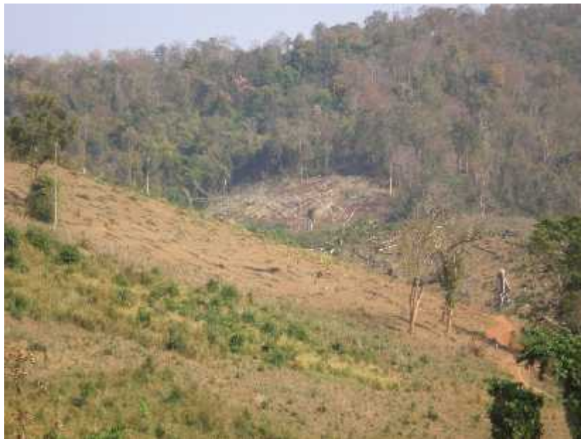
Intensifying swidden farming, Laos (A Malmer)