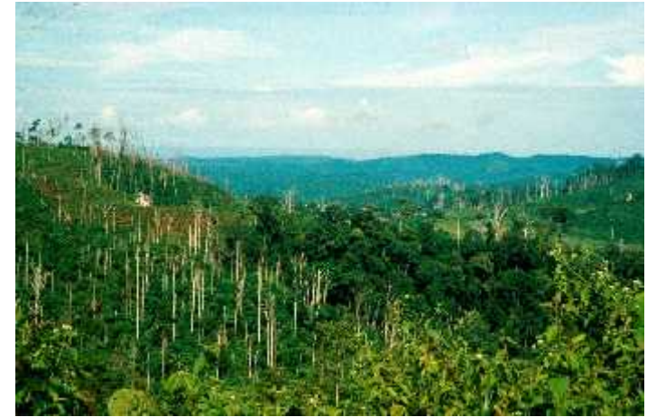
Mosaic landscape (A Malmer)