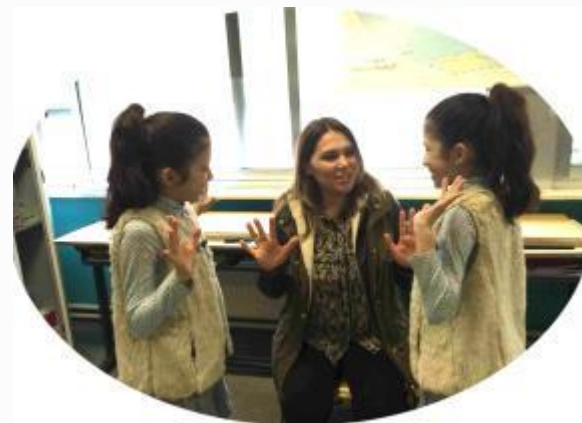
MUS-E sessions in schools with children and parents