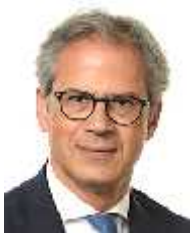
Rapporteur: Salvatore CICU

The European Union Solidarity Fund (EUSF) is an effective and important tool set up in 2002 in order to show EU solidarity towards disaster-stricken regions within Europe after severe floods in Central Europe.