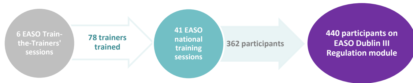
Number of participants in EASO trainings on Dublin III Regulation module by Member States (2012-2016)