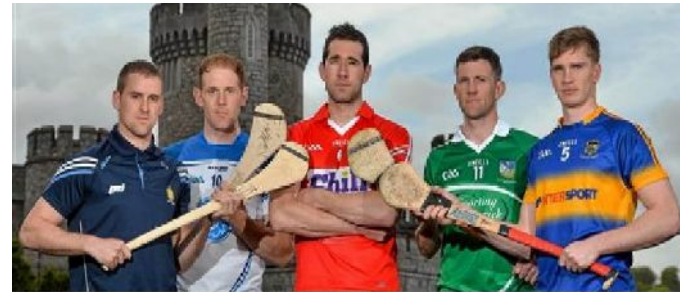
THE COUNTIES OF IRELAND