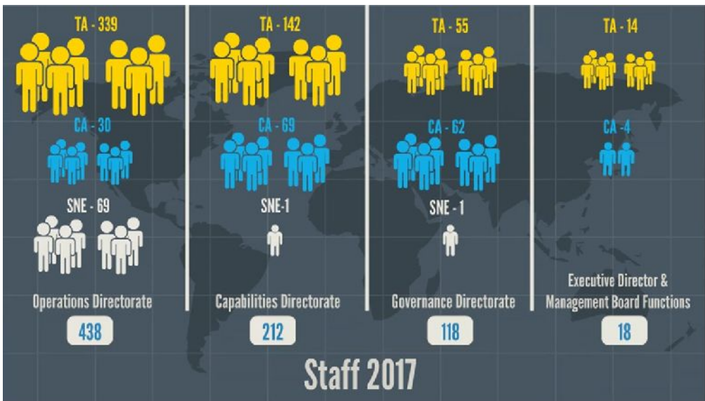
Europol staff allocation 2017

It was noted that following the audit findings of the European Court of Auditors, Europol established its procurement department in order to improve its Internal Control Framework. As regards the discharge recommendations, it was noted that Europol implements well its budget and keeps its carry-overs small, thereby adhering to the budgetary principle of annuality. Its Management Board adopted the rules on management of conflicts of interests in May 2017, in order to formalise the existing practices. In addition, Europol's anti-fraud strategy was adopted in February 2017.