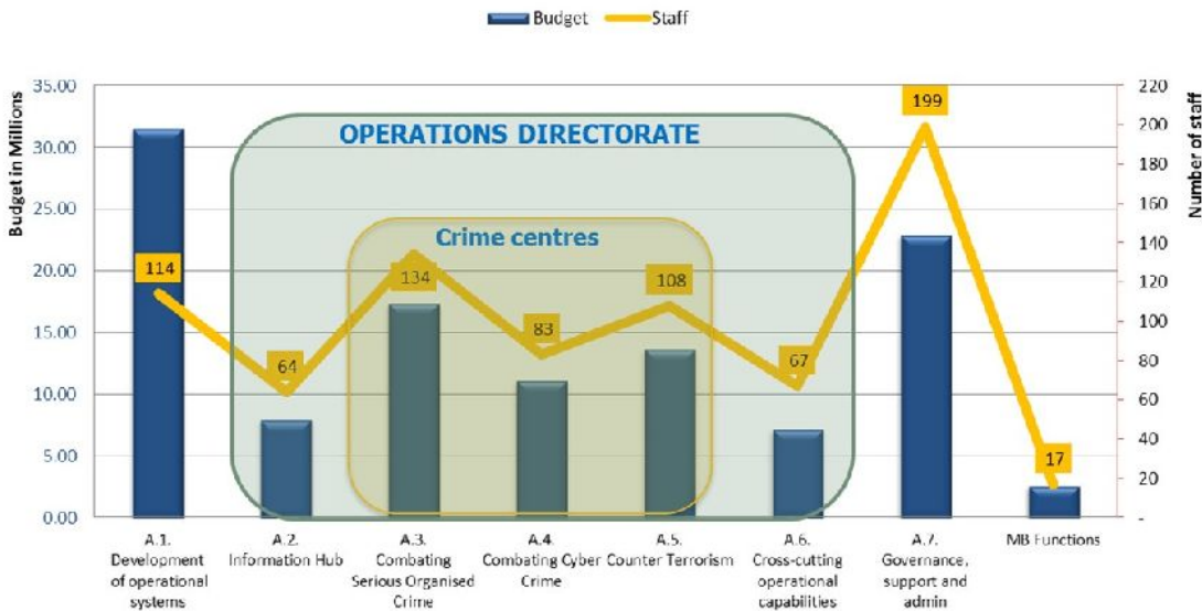
Europol's budget and staff allocation per WP activities

Europol's staff is divided across Operations Directorate (438 staff members), Capabilities directorate (212 staff members), Governance Directorate (118 staff members) and the Executive Director and Management Board Functions (18 staff members). The delegation was informed that Europol's facilities in The Hague were at full capacity, which was originally foreseen to be reached in 2022. The discussions were ongoing with the Dutch government to provide additional space resources within existing building or outside, but in vicinity.