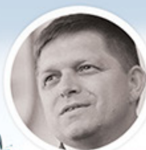
Robert Fico predseda vlády