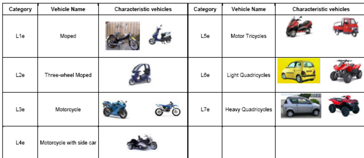
Figure 1: Examples of vehicles covered by the current Framework Directive 2002/24/EC

'L-category vehicles' is a term covering a wide range of different vehicle types with two, three or four wheels, e.g. powered cycles, two- and three-wheel mopeds, two- and three-wheel motorcycles, and motorcycles with side-cars. Examples of four-wheel L-category vehicles, also known as quadricycles, are on-road quads used on public roads and mini-cars.