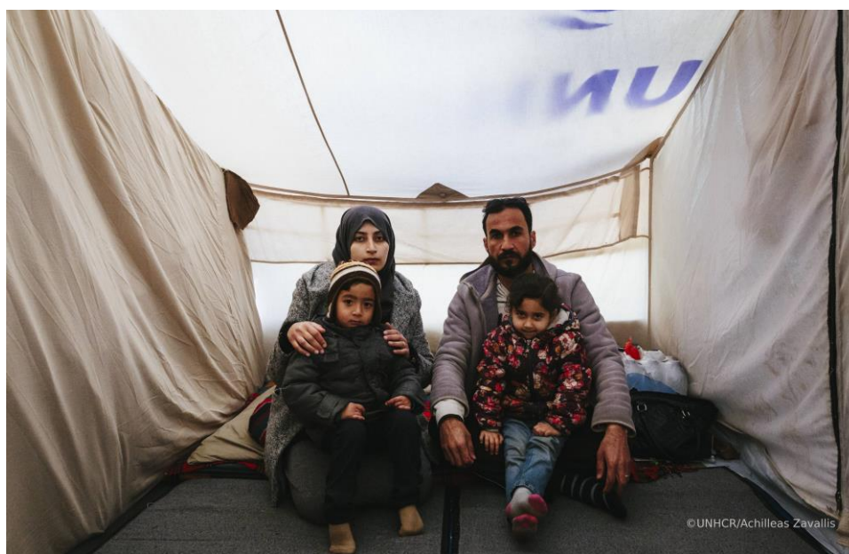
Asylum-seekers inside a UNHCR family tent in Moria reception centre, Lesbos.

4 Field Units in Evros, Ioannina, Leros, Rhodes