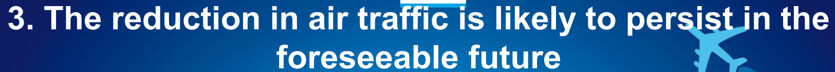
EUROCONTROL Draft Traffic Scenarios - 14 September 2020 (base year 2019/2020)