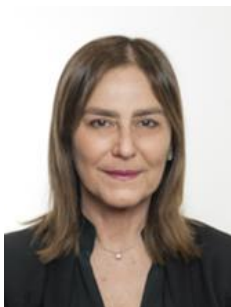
Ms Vincenza BRUNO BOSSIO Member Committee on Transport, Post and Telecommunications