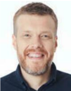
Mr Adrian ZANDBERG

Prawo i Sprawiedliwość (Law and Justice Party) - ECR