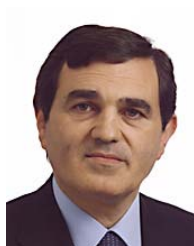
PATRICIELLO Aldo (IT, EPP-ED)