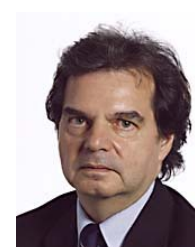
BRUNETTA Renato (3VP, IT, EPP-ED) 26.04.2004 / 28.04.2008