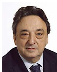
DE MICHELIS Gianni (IT, PES)