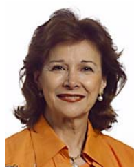
AYUSO Pilar (ES, EPP-ED)