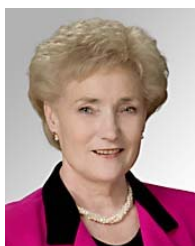
HENNICOT-SCHOEPGES Erna (LU, EPP-ED)