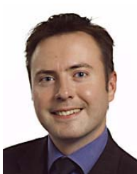
SMITH Alyn (GB, Greens/EFA)