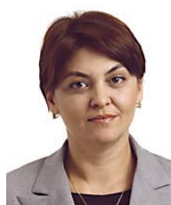
VĂLEAN Adina-Ioana (RO, ALDE)