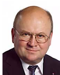
REMEK Vladimír (CZ, GUE/NGL)