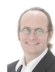
TURMES Claude (LU, Greens/EFA)