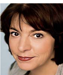
HARMS Rebecca (DE, Greens/EFA)