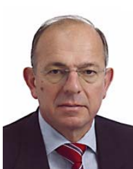
PAPARIZOV Atanas (BG, PES)