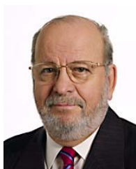
TRAKATELLIS Antonios (GR, EPP-ED)