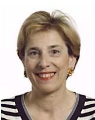
LIENEMANN Marie-Noëlle (FR, PES)