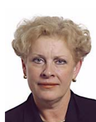
TRAUTMANN Catherine (4VP, FR, PES) 01.02.2007 -