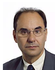
VIDAL-QUADRAS Alejo (ES, EPP-ED)