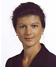
WAGENKNECHT Sahra (DE, GUE/NGL)