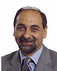
GUIDONI Umberto (IT, GUE/NGL)