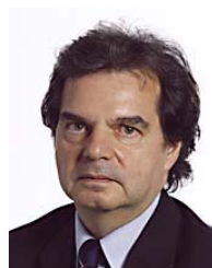
BRUNETTA Renato (IT, EPP-ED) 26.04.2004 / 28.04.2008