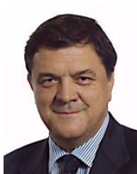
PANZERI Pier Antonio (IT, PES) 21.07.2004 / 21.06.2005