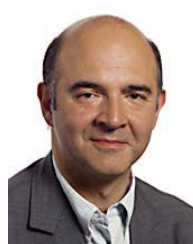
MOSCOVICI Pierre (FR, PES) 21.07.2004 / 14.09.2005