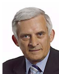
BUZEK Jerzy (PL, EPP-ED)