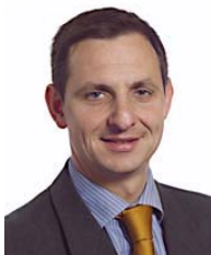
CHATZIMARKAKIS Jorgo (DE, ALDE)