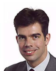
GYÜRK András (HU, EPP-ED)