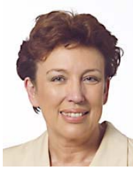
BACHELOT-NARQUIN Roselyne (FR, EPP-ED) 22.07.2004 / 26.06.2005