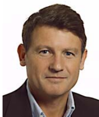
PEILLON Vincent (FR, PES) 21.07.2004 / 27.11.2007