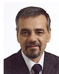
URUTCHEV Vladimir (BG, EPP-ED)