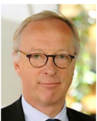
HÖKMARK Gunnar (SE, EPP-ED)