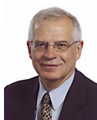
BORRELL FONTELLES Josep (ES, PES)