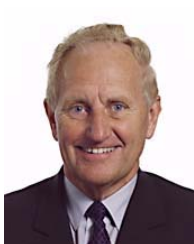
DOVER Den (GB, EPP-ED)