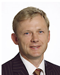
BIRUTIS Šarūnas (LT, ALDE)