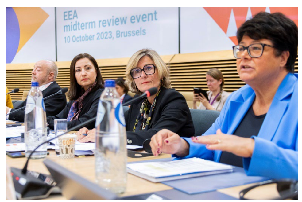
EEA Midterm review event, 10 October 2023

Moreover, CULT has worked hard to turn the vision of an 'European Education Area' (EEA) into reality, and to make the system of European Schools fit for the future. Not least, a key objective has been to entrust citizens with a better understanding of our common past and to foster a (self-)critical European historical consciousness that is essential for addressing present issues and work towards a common future.