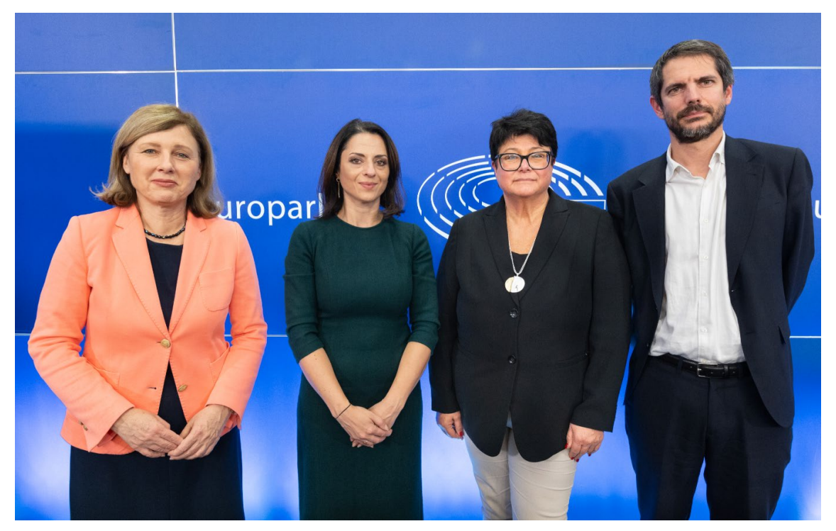
Press conference on European Media Freedom Act - outcome of the inter - institutional negotiations (15/12/2023)

Finally, CULT contributed to several significant legislative and non-legislative reports that will shape the Union's digital transformation in the years to come, examples are the CULT contribution to the Digital Services Act and to the Artificial Intelligence Act.