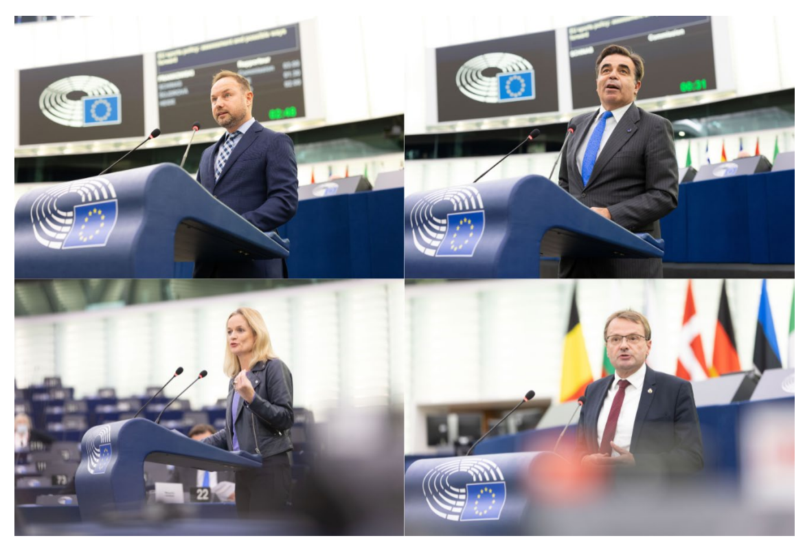
EP Plenary Session - EU sports policy: assessment and possible ways forward (22/11/2021)

Finally, during the plenary sittings, CULT addressed questions relating to sports in other EU institutions, ensuring a direct form of parliamentary scrutiny when it comes to how the sector is evolving in the Union.