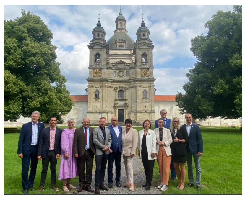
European Capitals of Culture mission to Kaunas, Lithuania (July 2022)