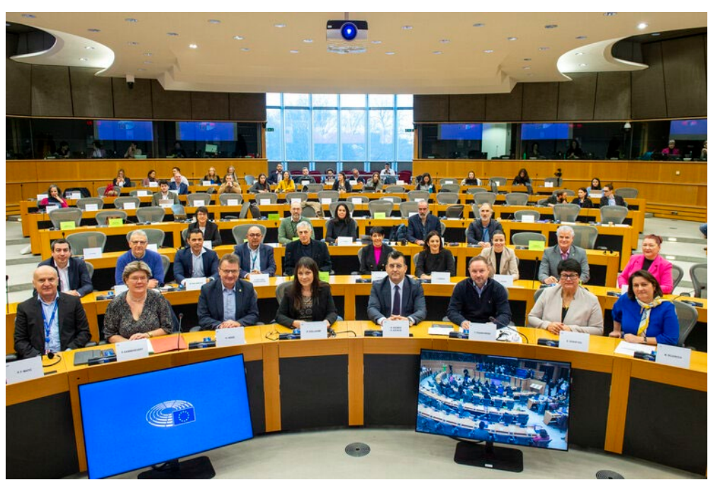
CULT Committee meeting on 24 January 2024