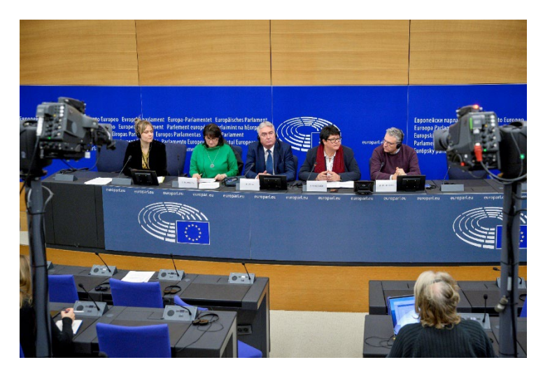
EP press conference on 'Negotiations on Erasmus+, Creative Europe and Solidarity Corps programme – state of play and where next ?(12/02/2020)

The budget also provides an important avenue for pioneering new initiatives through pilot projects and preparatory actions. Here, CULT has been behind some immensely successful schemes (multilingual subtitling of European content, media literacy, media pluralism monitoring etc.). Several of these initiatives have eventually been or will be included in a standing EU programme such as Erasmus+ or Creative Europe. CULT has also worked hard to secure sustainable ventures that provide high-quality, independent coverage of Union affairs.