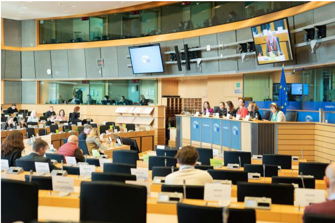
IMCO Members at a committee meeting