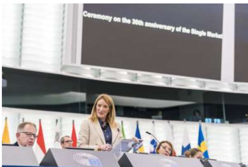
President Roberta Metsola addressing the plenary session of January 2023, during which a ceremony marking the 30th anniversary of the single market was held and a resolution on the same topic adopted