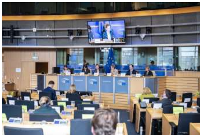
Structured dialogue with Margrethe VESTAGER, Executive Vice President of the European Commission for a Europe Fit for the Digital Age, 27 March 2023

IMCO held several exchanges of views with Commissioner Gentiloni on the customs union. The Committee addressed the Commission on the implementation of IT systems and their delays in the Member States and how the Commission aims to assist Member States to reach implementation deadlines. Members also asked repeatedly about the customs reform, including the proposal on a revised Union Customs Code, which had been delayed by the Commission several times. In this regard, they highlighted the report by the Wise Group on challenges facing the customs union, especially due to eCommerce and the new geo-political context, and their impact on new initiatives.