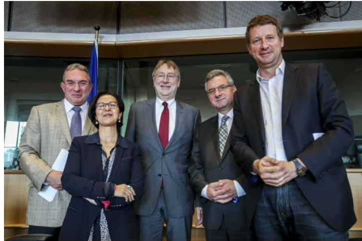
The new INTA Bureau from left to right: 3rd Vice Chair Iuliu Winkler (EPP) 1st Vice Chair Tokia Saïfi (EPP), Chair Bernd Lange (S&D), 4th Vice-Chair Jan Zahradil (ECR) and 2nd Vice-Chair Yannick Jadot (Greens/EFA)