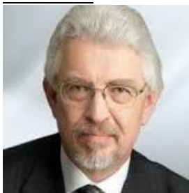
Mr Ojārs KALNIŠ

Chair, Foreign Affairs Committee Unity Party - EPP