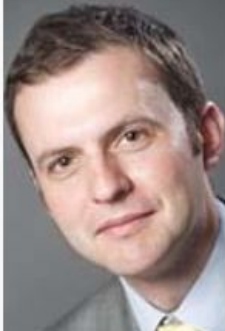
Mr Stephen GETHINS

Foreign Affairs Committee Scottish National Party - Greens/EFA