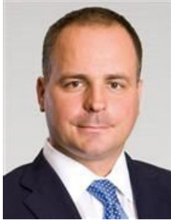
Mr Juraj DROBA

Vice-Chair, Foreign Affairs Committee SaS - ALDE