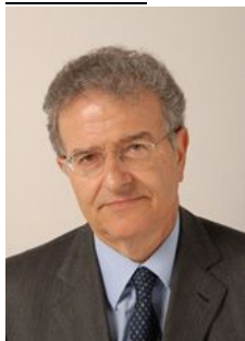
Mr Fabrizio CICCHITTO

Chair, Foreign and European Community Affairs Area Popolare (NCD-UCD)-EPP