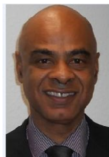
Mr Karl-Heinz (Charles M.) HUBER

Chair, Foreign Affairs Committee CDU/CSU - EPP