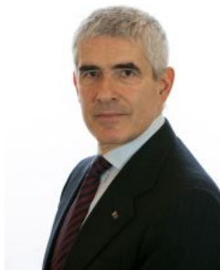
Mr Pier Ferdinando CASINI

Chair, Foreign Affairs, Emigration Committee AP (NCD-UDC) - EPP