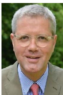
Mr Norbert RÖTTGEN

Chair, Foreign Affairs Committee CDU/CSU - EPP