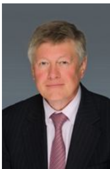
Mr Arturas PAULAUSKAS

Chair, Committee on Foreign Affairs Social Democratic Party - S&D