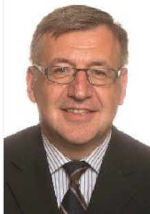
Mr Steven VANACKERE

Chair, International Affairs Committee CD&V - EPP