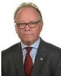
Mr Øyvind HALLERAKER

Vice-Chair, Standing Committee on Foreign Affairs and Defence