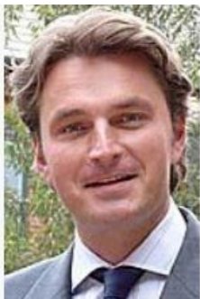
Mr Daniel KAWCZYNSKI

Foreign Affairs Committee Scottish National Party - Greens/EFA