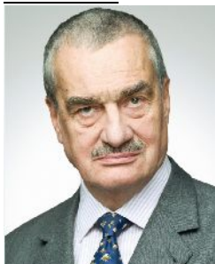
Mr Karel SCHWARZENBERG

Chair, Committee on Foreign Affairs Poslanecký klub TOP 09 a Starostové - EPP