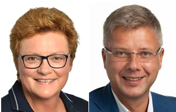
Younous Omarjee (The Left)