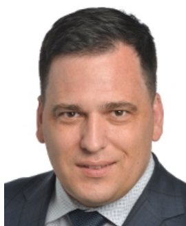
CONT Rapporteur: Administrator: