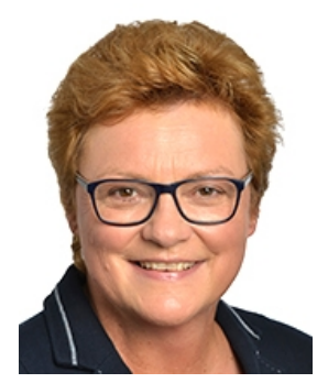
Reporting back to committee from CONT mission to Italy on 25 - 27 May 2022