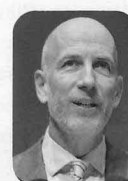
Martin Kocher Federal Minister for Labour

My sincerest congratulations to the great success of your 17 th Salzburg Europe Summit 2021 end of September. You have had highlevel speakers.