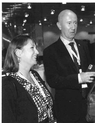
Photo left: Andrija Petković, President of the Municipal Assembly of Tivat in Montenegro.