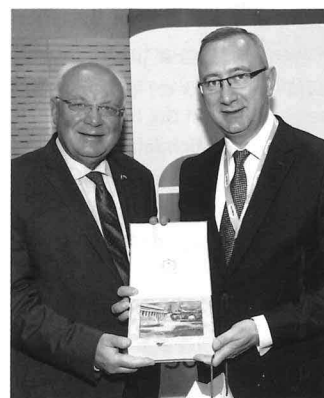
Photo right: Vladimir Shapsha, Governor of the Russian Region of Kaluga