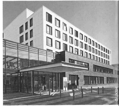
University Hospital Schleswig-Holstein, Germany

Founded in 1982, VAMED has become the leading global service provider in the healthcare sector. The group has implemented around 1,000 projects in 95 countries on five continents. VAMED's portfolio ranges from project development, planning and turnkey equipment via maintenance, technical, commercial and infrastructure services to the total operational management of health care facilities.