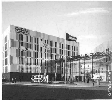
Reem Hospital, Abu Dhabi, U.A.E.