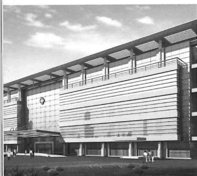
Wu'An Country People's Hospital Hebei, China