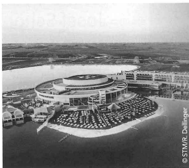
St. Martins Spa & Lodge, Austria