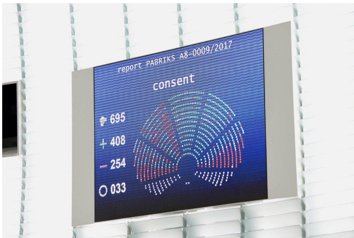
CETA vote result